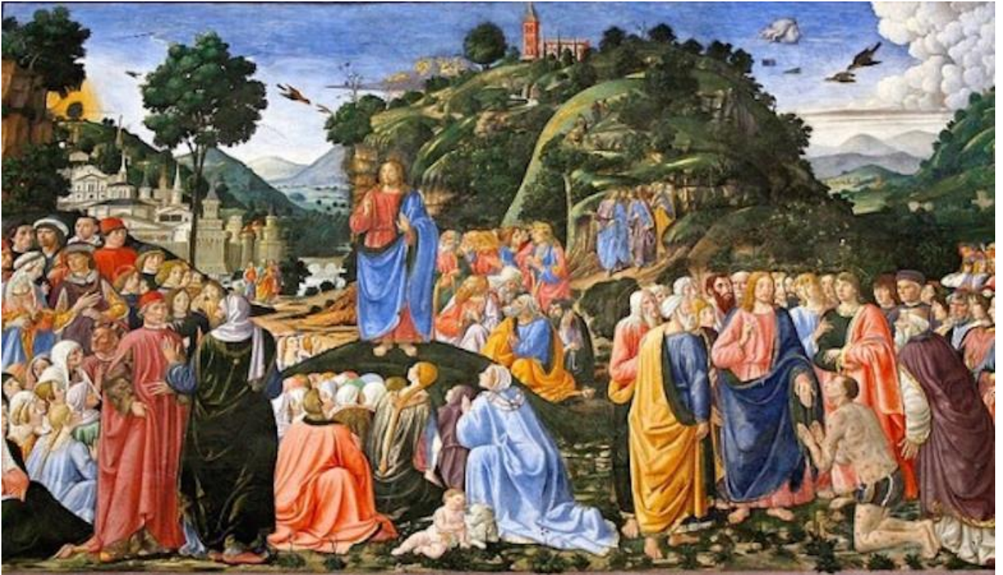
The Sermon on the Mount (Cosimo Rosselli, 1439-1507)

When Jesus saw the crowds, he went up the mountain, and after he had sat down, his disciples came to him. He began to teach them, saying: “Blessed are the poor in spirit, for theirs is the kingdom of heaven.” Matthew 5:1–3