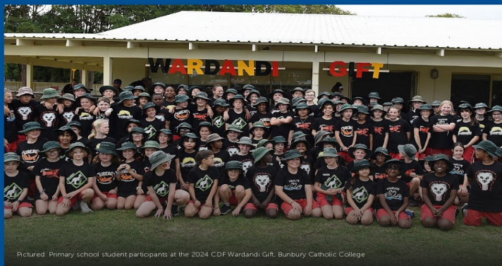
Pictured: Primary school student participants at the 2024 CDF Wardandi Gift, Bunbury Catholic College

Phone (08) 9791 3750 Fax (08) 9791 3751 Mobile 0412 561 621 A/h (08) 9721 4778