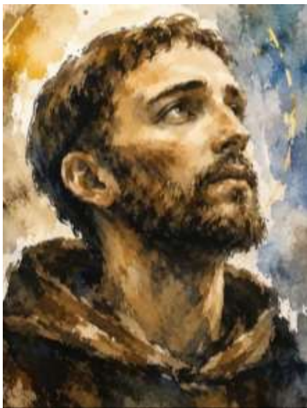
ST. FRANCIS, PRAY FOR US

who was conceived by the Holy Spirit, born of the Virgin Mary, suffered under Pontius Pilate, was crucified, died and was buried; he descended into hell; on the third day he rose again from the dead; he ascended into heaven, and is seated at the right hand of God the Father almighty; from there he will come to judge the living and the dead. I believe in the Holy Spirit, the holy catholic Church, the communion of saints, the forgiveness of sins, the resurrection of the body, and life everlasting. Amen.