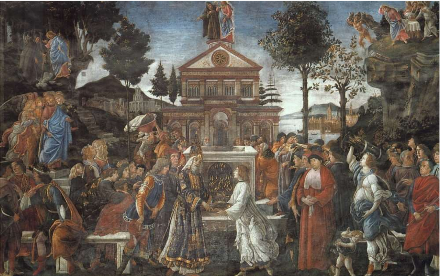
The Temptation of Christ (1481-1482) by Sandro Botticelli

At that time Jesus was led by the Spirit into the desert to be tempted by the devil. He fasted for forty days and forty nights, and afterwards he was hungry. The tempter approached and said to him, “If you are the Son of God, command that these stones become loaves of bread.” Matthew 4:1–3