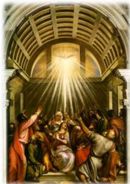
Pentecost, c.1545, Titian

and by the Holy Spirit was incarnate of the Virgin Mary, and became man. For our sake he was crucified under Pontius Pilate, he suffered death and was buried, and rose again on the third day in accordance with the Scriptures. He ascended into heaven and is seated at the right hand of the Father. He will come again in glory to judge the living and the dead and his kingdom will have no end. I believe in the Holy Spirit, the Lord, the giver of life, who proceeds from the Father and the Son, who with the Father and the Son is adored and glorified, who has spoken through the prophets. I believe in one, holy, catholic and apostolic Church. I confess one Baptism for the forgiveness of sins and I look forward to the resurrection of the dead and the life of the world to come. Amen.