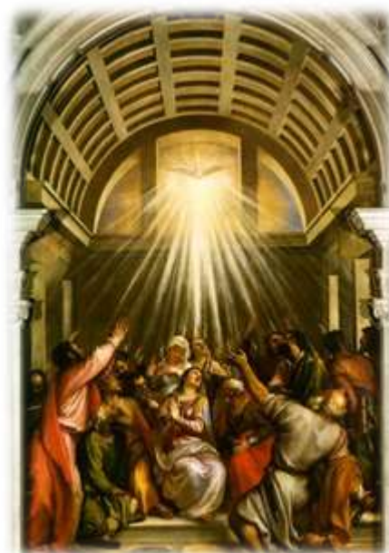
Pentecost, c.1545, Titian

and by the Holy Spirit was incarnate of the Virgin Mary, and became man. For our sake he was crucified under Pontius Pilate, he suffered death and was buried, and rose again on the third day in accordance with the Scriptures. He ascended into heaven and is seated at the right hand of the Father. He will come again in glory to judge the living and the dead and his kingdom will have no end. I believe in the Holy Spirit, the Lord, the giver of life, who proceeds from the Father and the Son, who with the Father and the Son is adored and glorified, who has spoken through the prophets. I believe in one, holy, catholic and apostolic Church. I confess one Baptism for the forgiveness of sins and I look forward to the resurrection of the dead and the life of the world to come. Amen.