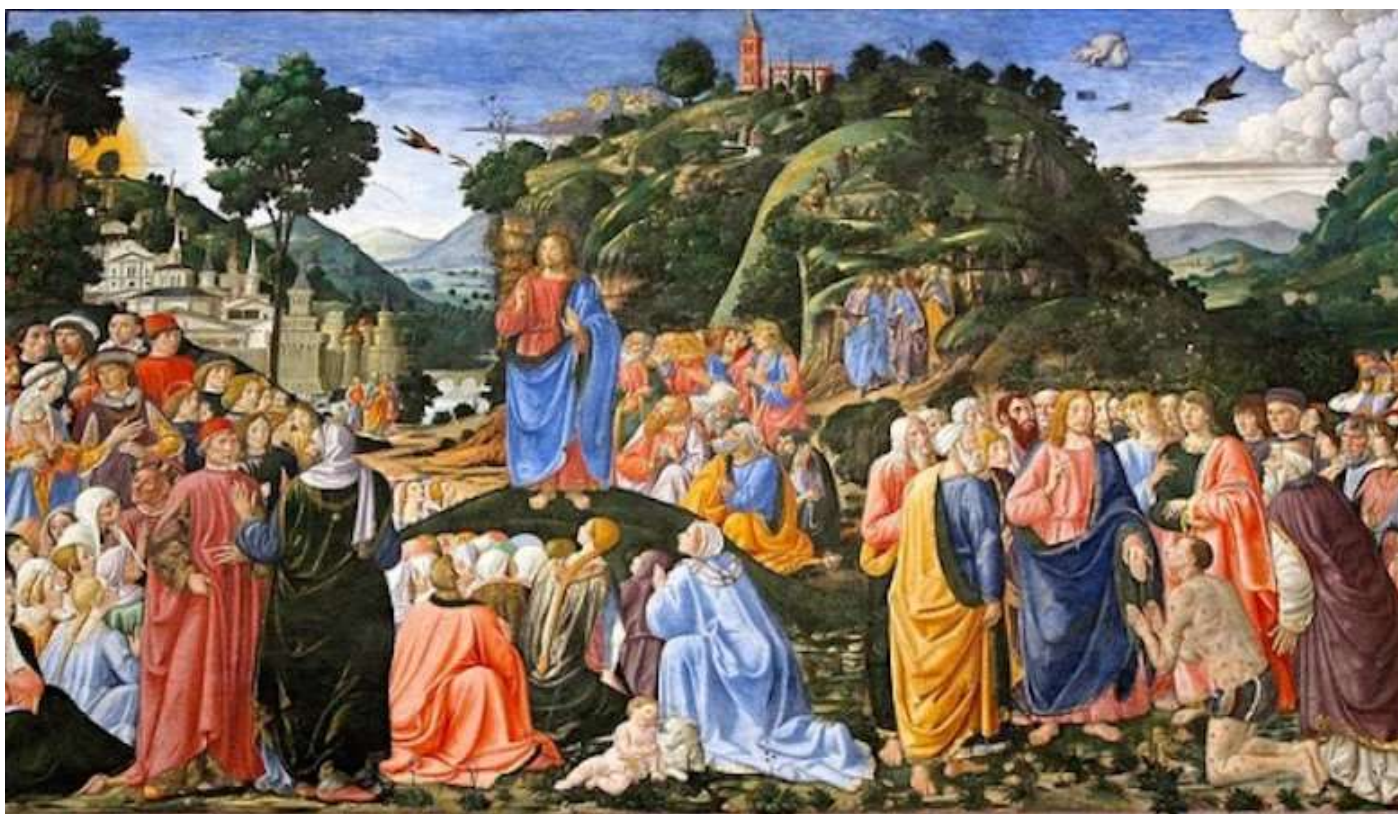
The Sermon on the Mount (Cosimo Rosselli, 1439-1507)

Jesus said to his disciples: "You are the salt of the earth. But if salt loses its taste, with what can it be seasoned? It is no longer good for anything but to be thrown out and trampled underfoot." Matthew 5:13