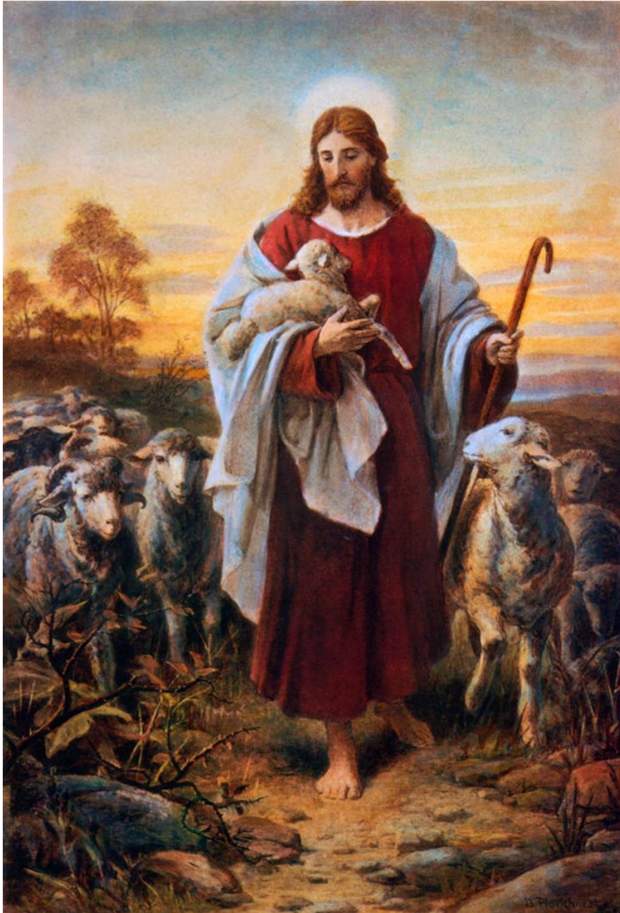
The Good Shepherd, Bernhard Plockhorst (1825–1907)

“When he has driven out all his own, he walks ahead of them, and the sheep follow him, because they recognize his voice. But they will not follow a stranger; they will run away from him, because they do not recognize the voice of strangers.” John 10:4–5